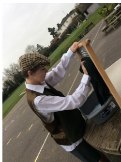
A Victorian peg doll