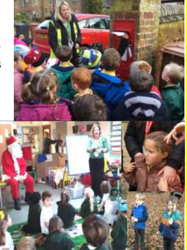
The fame was amazing Because