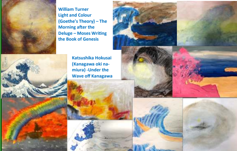
William Turner Light and Colour (Goethe's Theory) – The Morning after the Deluge – Moses Writing the Book of Genesis

This term Year 4 are working on their topic 'Oceans and Rivers'. The children were set art homework last week, in which they had to create their own seascapes based on the style of either the English watercolourist William Turner, who's marine paintings are turbulent yet soft or the Japanese painter/printmaker, Hokusai who's work is very graphic. I am sure you would agree that they have produced some wonderful images. Well done children!