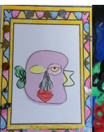
Year 1: Vegetable printing