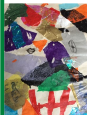
Year 3: Collage