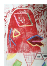
Year 5: Printing with polystyrene.