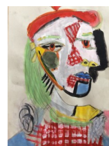
Year 4: Painting