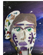
Year 6: 3D Sculpture