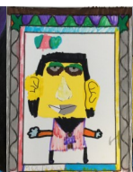
Reception 1 & 2 : A collage