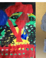
Year 2: Sculpture